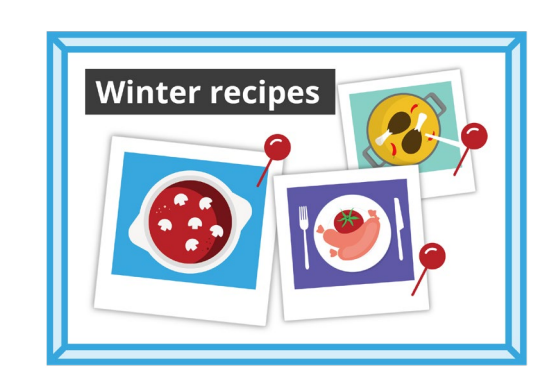
Name your Board according to the types of Pins you intend to save

You can create as many Boards as you like and name them based on the types of Pins on each. For example, you might have a Board for recipes, travel destinations or garden ideas . Boards can also be shared with other people by inviting them to contribute to the Board.