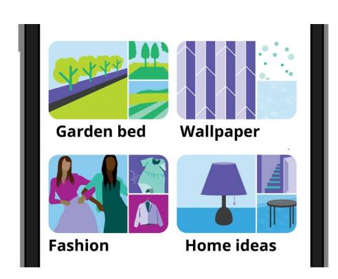
Boards let you save photos, or Pins, that you like, so you don't have to search for them again

The process of creating a Pinterest account on a mobile device is similar, so you should still be able to follow along.