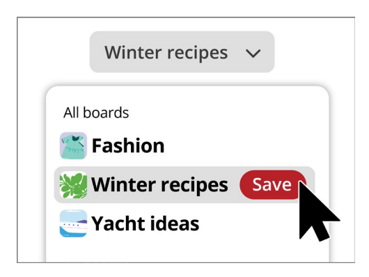
When you see a Pin you like, choose the Board you want to save it to